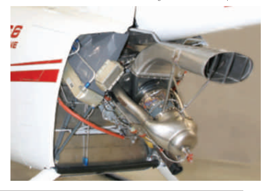
General Aviation October 2010

A single Rolls-Royce model 250-C300/A1 (commercial designation RR300) free turbine turboshaft engine powers the R66. The engine is mounted at a 37 degree nose-up attitude aft of the baggage compartment. A sprag type overrunning clutch or freewheel unit is splined