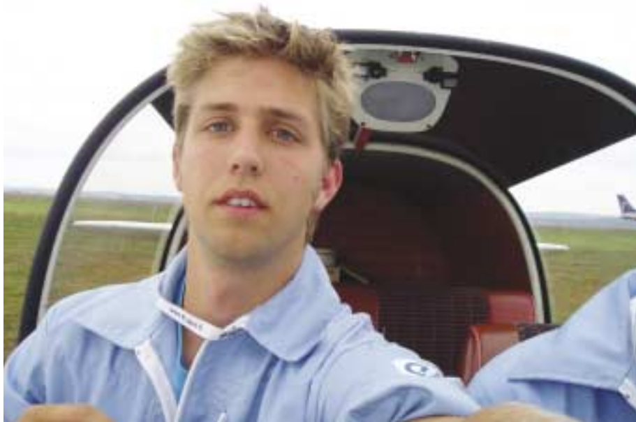
Top: caption in here caption in here Above: caption in here caption in here Left: caption in here caption in here