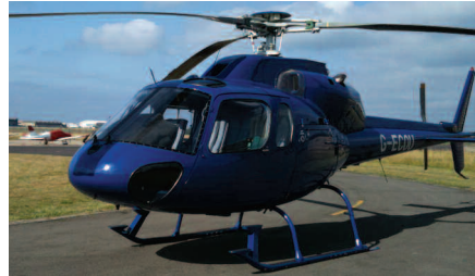
Bottom: credit for saving Lee on Solent goes to the indefatigable Lee Flying Association