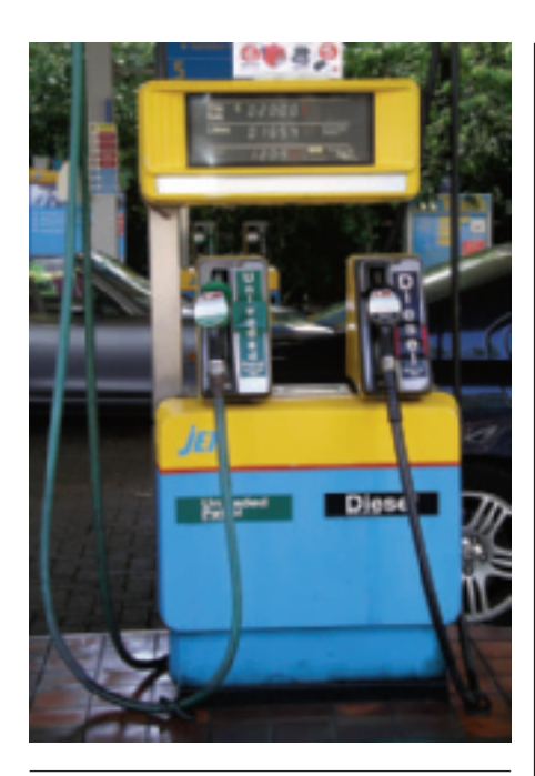
Ultimately GA must find a fuel that is not exclusive to piston-engined aircraft

There are severe restrictions on the refinery components that can be used to blend avgas. Only the best hydrocarbon streams can be used, carefully blended in segregated tanks to