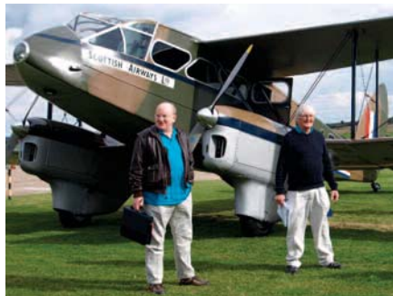
Above: flights in a Rapide will be on offer Left: members at last year's AOPA Bonus Day Below: some 50 aircraft flew into Duxford last year