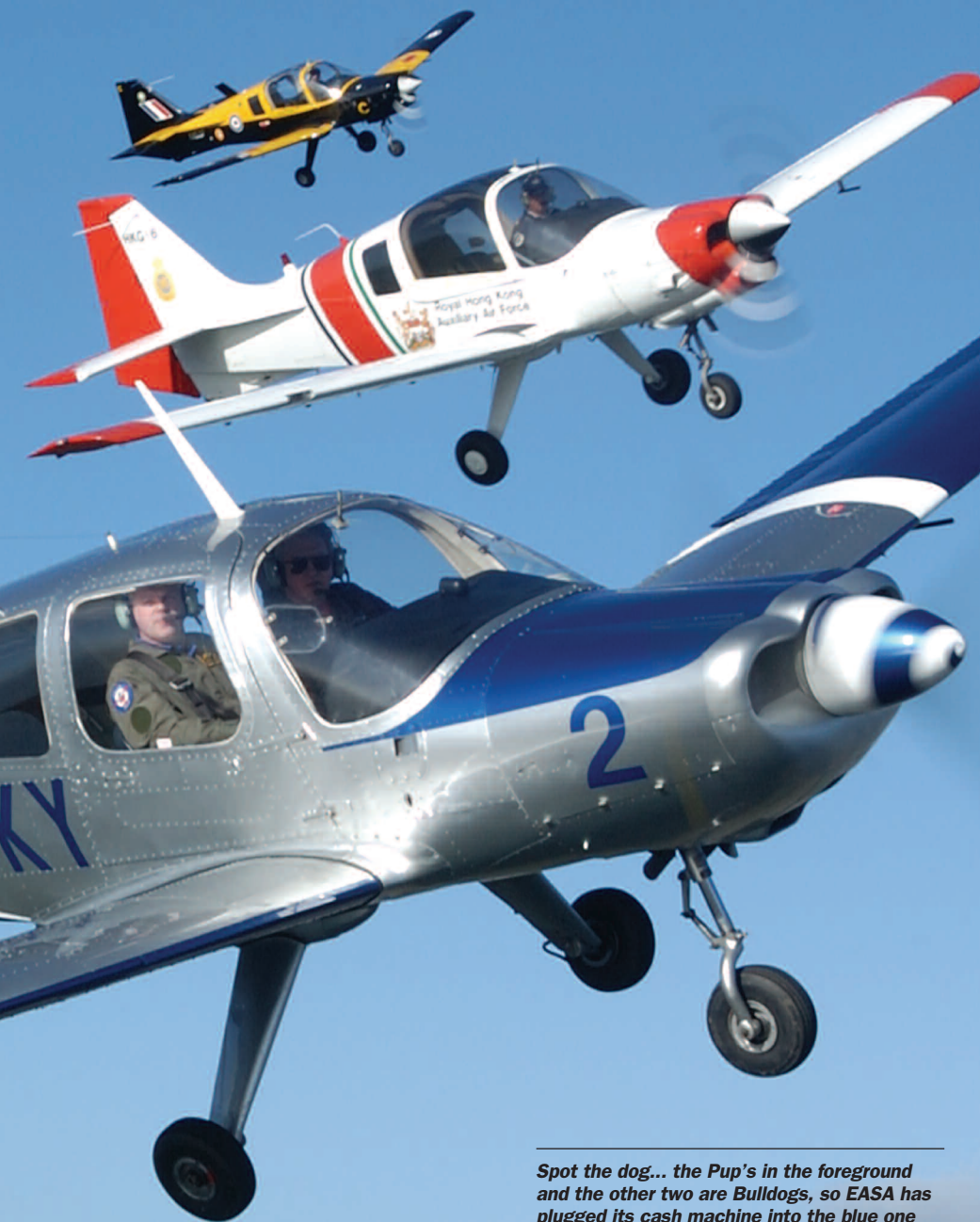
Spot the dog... the Pup's in the foreground and the other two are Bulldogs, so EASA has plugged its cash machine into the blue one

In addition, the basic core skills to cope with dynamic events such as extremes of attitude and imminent speed excursions are not taught during JAR-FCL flight