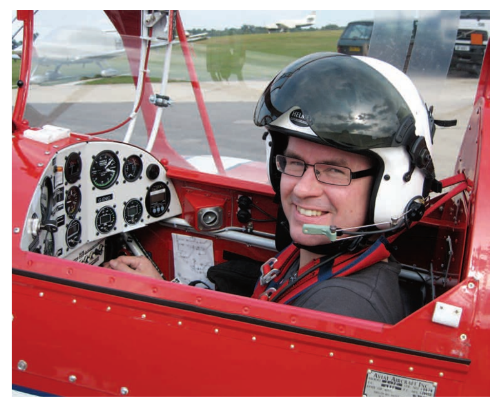
General Aviation April 2011