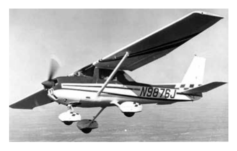
Would sir care to try something different? Tipsy Nipper (top) Cessna Aerobat (above) and (from left) Pitts, Extra 300 and Yak 52