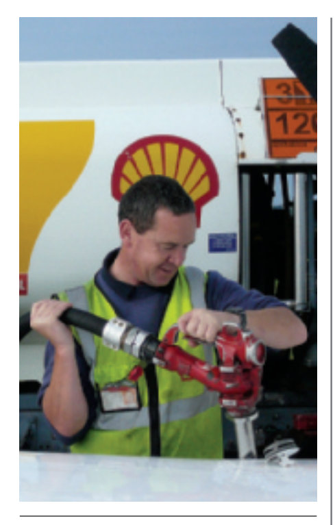
National fuel taxes may be challenged

AOPA-Germany based its claim on a European Court judgement dating back to June 1999 when the airline Braathens challenged the Swedish imposition of an