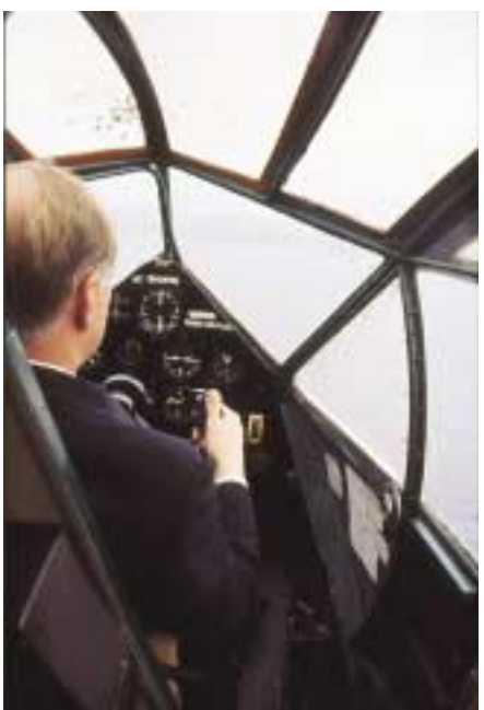
Left: the panel has a typical vintage haphazardness not confined to the type Above: the instructor despensed advice from the door hatch behind the sole seat Below: Rapides have flaps in basic up and down form

moderately well and allow a light-load fencecrossing speed of 70mph. The next stage, though, is when the Rapide shows some strange spirit. As I discovered to my embarrassment, any pilot who is doggedly determined to three-point anything that he handles may have a shock; a tail-down wheeler presents no problems, but in certain sets of conditions a precise all-wheels-on touchdown may lead to a marked wing-drop that is not easy to put right.