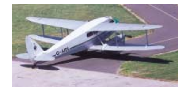
General Aviation April 2006

To operate on a C of A, a type is required to have a CAA approved design authority and, fortunately, the DH 89A is covered by de Havilland Support Limited, based at Duxford in Cambridgeshire. Clearly and understandably, the Rapide has an enthusiastic following, which should ensure that the unique sight and unmistakeable sound will be with us for many years to come.