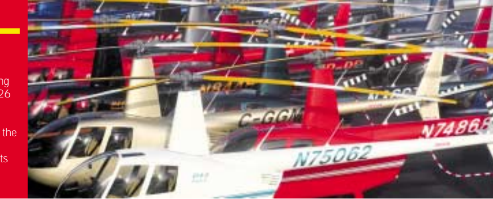
General Aviation April 2006

Adams, one of the longest-established aviation supply companies in the UK, has been operating since 1968 and has a purpose-built distribution headquarters in Hunter House at Biggin Hill. It has customers all over the world and is particularly strong in Europe, employing French, German, Italian, Polish, Spanish and Swedish staff to cope with demand.