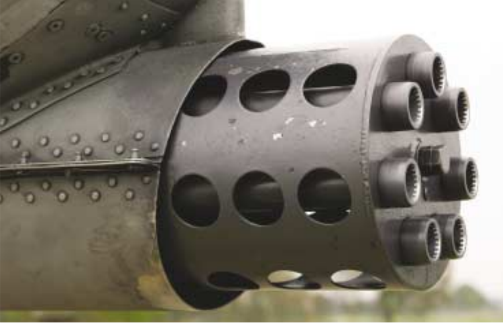
Above left: An A10 lets rip with with its extraordinary GAU-8 Gatling gun, seen above in close-up

weaponry. Pilots train on the T-37 and T-38 for around 12 months before moving onto the Introduction to Fighter Fundamentals course on the AT-38 – a T-38 designed to make A-10 pilots feel at home, with a nearly identical cockpit layout. Apart from higher speeds and very different turn performance, the AT-38 flies in a remarkably similar manner to the A-10. After four to five months on the AT-38 pilots get their hands on an A-10. The 81st's pilots are a surprisingly young bunch, but most already have combat experience in Afghanistan