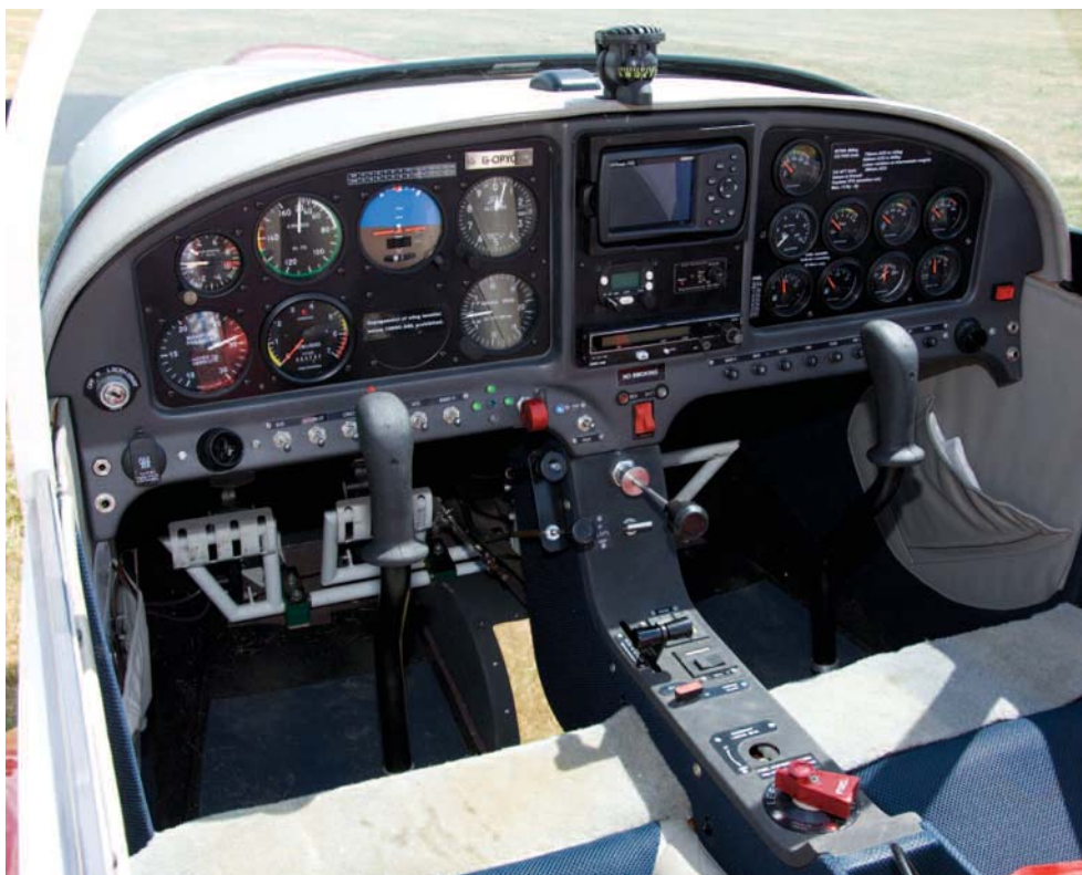
Left: neat and compact cockpit and panel layout; everything falls neatly to hand but there is little room for additions! Lower left: sculpted racing seat and Alpi's own four point harnesses. Baggage bay is limited to 35kgs

little and wait... and at just over 40 knots she flies herself off the runway. We have only used around 200 metres. It immediately becomes apparent that aileron and elevator response is light and well balanced and keeping her straight is easy. Once I'm sure we are heading skywards at best climb speed (60 knots) I dab the brakes and move the undercarriage lever up. It takes around ten seconds for the gear to retract fully. The effect on the trim is obvious and I compensate for the changes. Next, I increase the climb speed to 65 knots before cleaning up the flaps. Once again, the trim change is obvious. It quickly becomes clear to me that this aircraft is going to need lots of trim changes. A small gripe here; the trim switch is located on the centre console and involves moving your hand down – off the