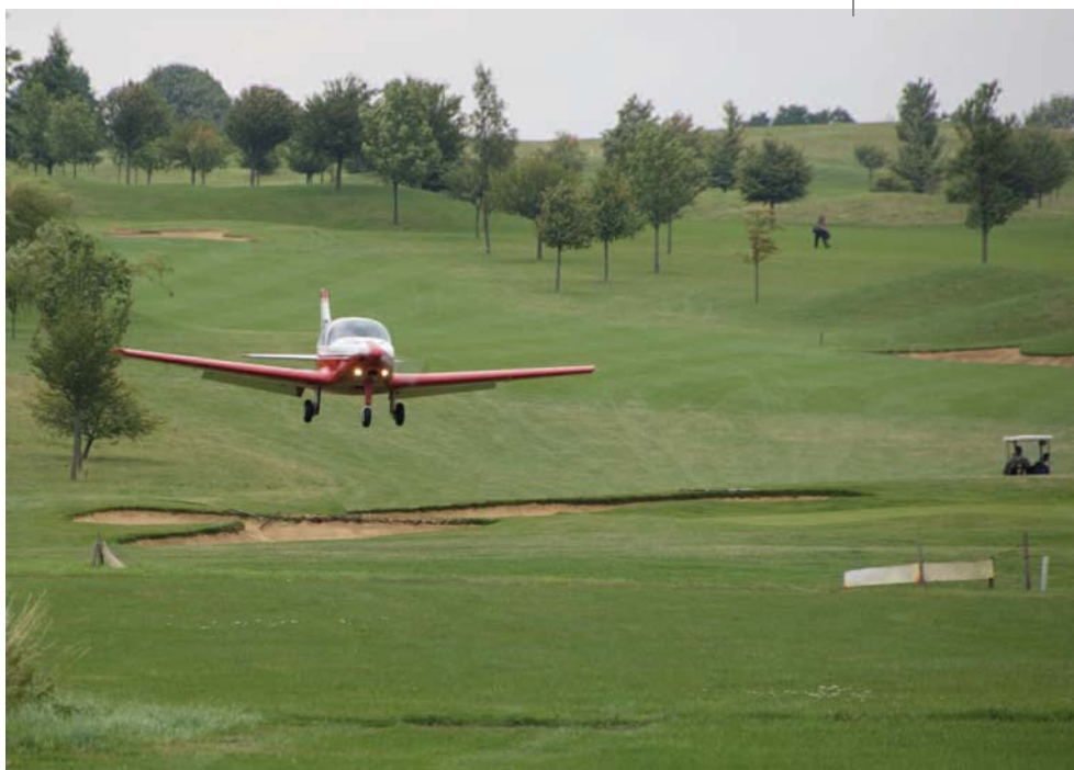
Left: curved approach at Graveley means flying over a corner of the golf course Bottom left: with hanger space at a premium, G-OPYO is stored on a hoist

pressure even further and it gives up flying. It flicks quickly and positively to the right and returns to straight and level flight. Textbook.