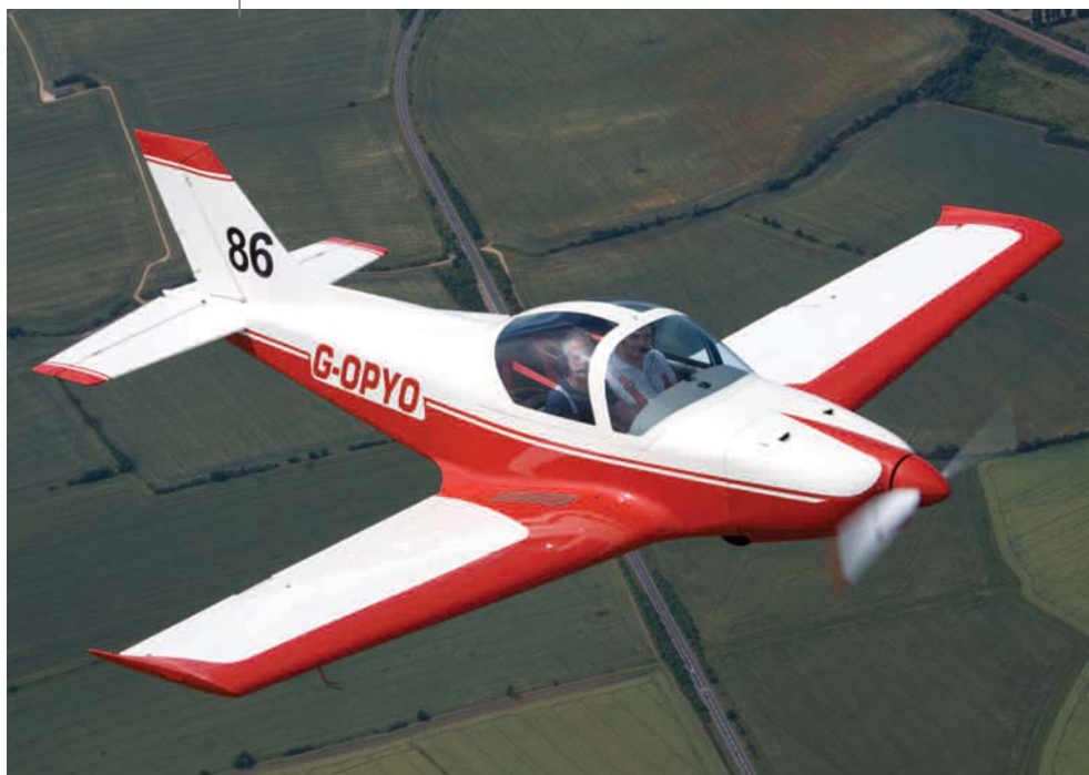
Above: fuel efficiency and speed make the Hawk an excellent tourer. This photo: great handling, although the speed tends to wash off quickly in tight turns

Next, I climb up to 5000 feet to explore the slow-speed handling. With checks complete I reduce power almost to idle and pitch the nose up, decelerating at the standard one knot per second. As the speed steadily decays I check the ball is in the middle and bring the power right back