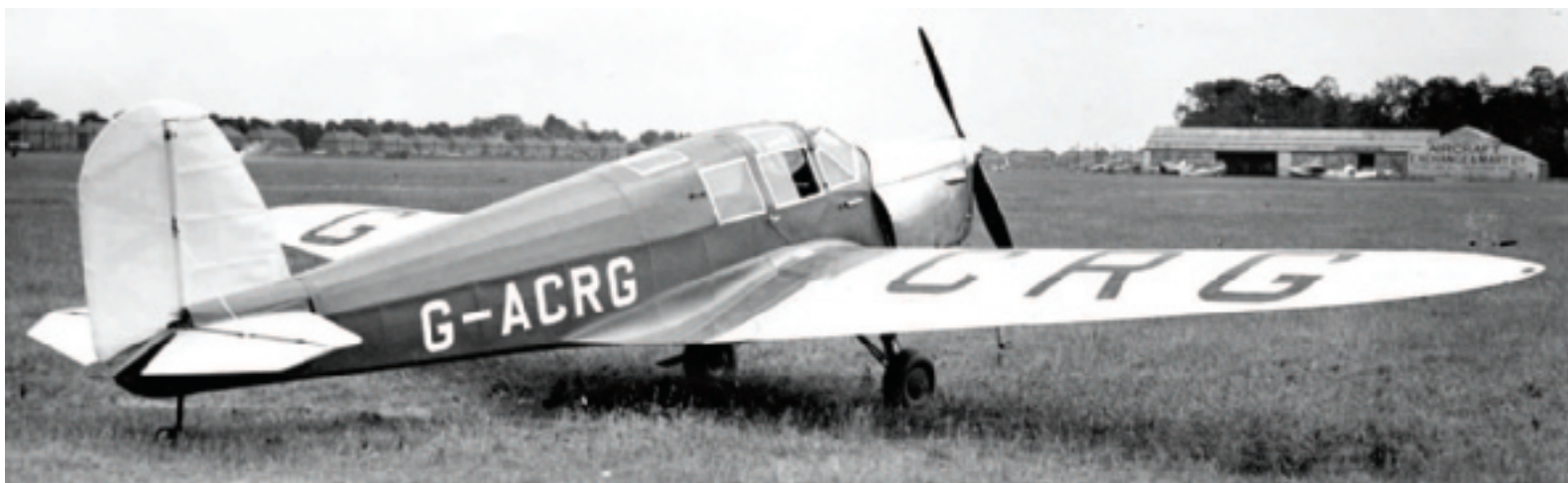
Left and below: British Klemm Bk.1 Eagle, pictured here in 1934, was an ambitious development with a retractable undercarriage, but no example survives

scale on a strange type one must be ready for almost anything. Perhaps I had been spoilt, though, for receiving prior advice that I would find this to be a very tame aeroplane. How true this was. Speed took its time to decay and the stall was reluctant to make itself felt. When eventually (below the minimum ASI reading) the nose went down, it did so in a genteel manner and the wings remained level, immediately bringing back to mind the maker's safety claim. The only feature that I remember specifically is the slightly unnerving feeling on Cataract-equipped G-AFCL: when fully