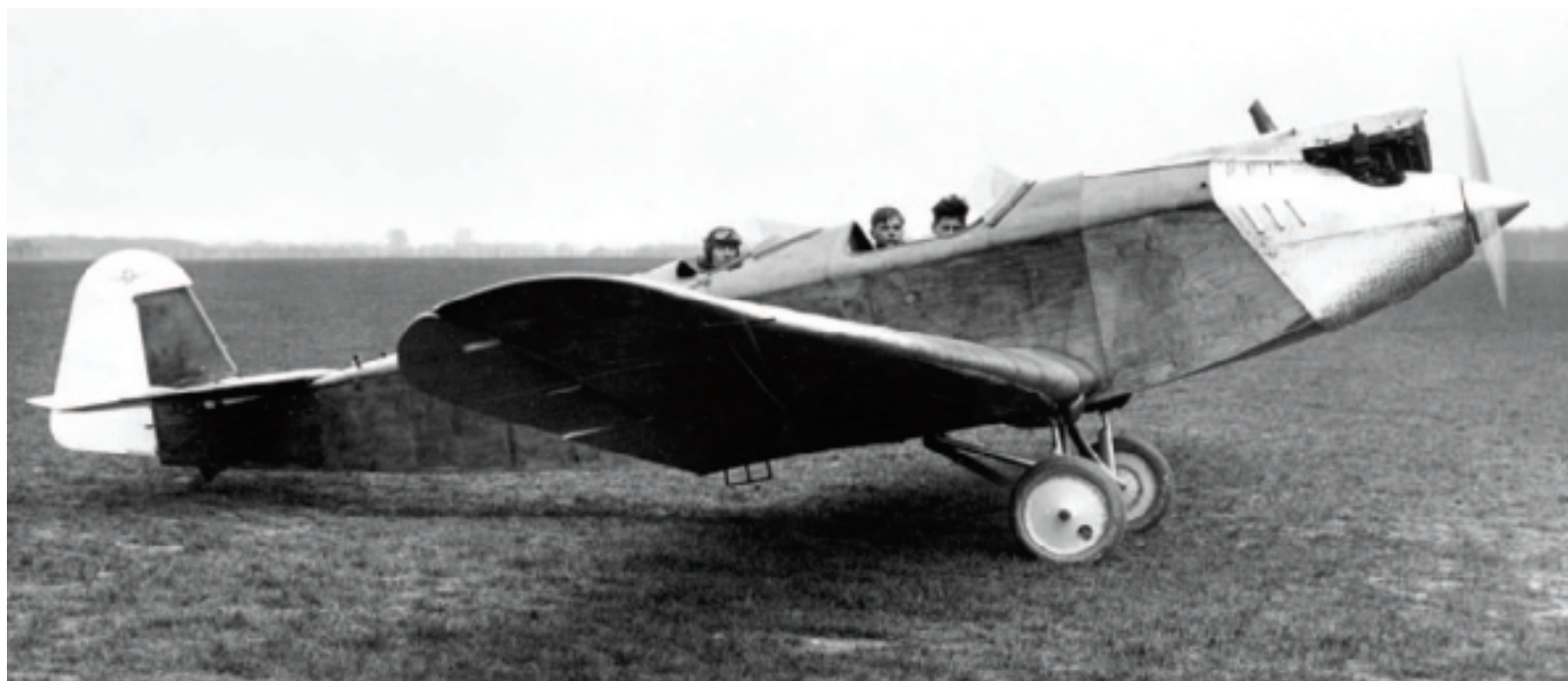
Below: the front cockpit of the Klemm L25 was roomy enough for two people