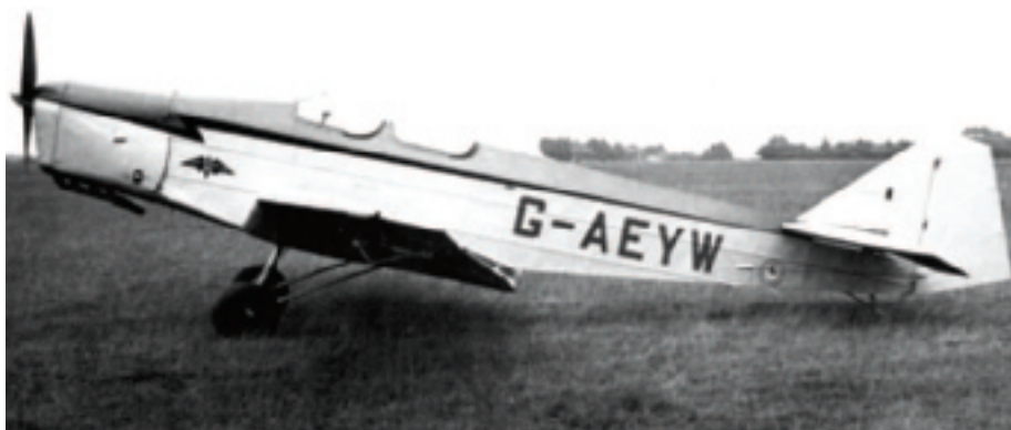
Top right: Swallow 2 had a 42-foot wingspan but the wings could be folded

On the eventual outbreak of war, not many Swallows were impressed into active military service, but a few, including G-AFCB which became BK 575 and operated from Ringway (now Manchester Airport) and G-AFGD, recruited as BK 897, appropriately was converted to a glider for trials at Farnborough. Others were distributed to Air Training Corps units as ground instructional airframes. At least one, though, flew throughout the war, camouflaged, yet retaining its civil registration