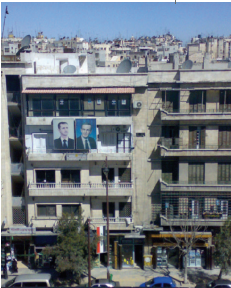
Left: night stop in Aleppo, Syria, where women pilots are rare Below: view from the office window - this happens to be in the hold over London Right: the view from final approach into Jersey is pretty special